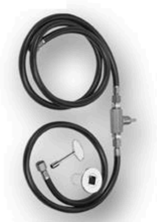
— Exit Gas Hose (To Air Mixer if Propane)