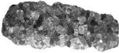
— Fireglass (2" depth for propane)