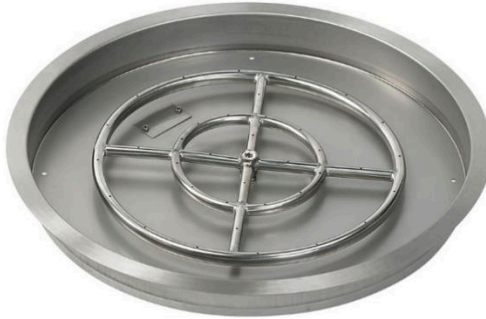
— Burner Assy.